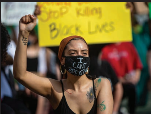
Top: Protestors march down Washington Street in May.