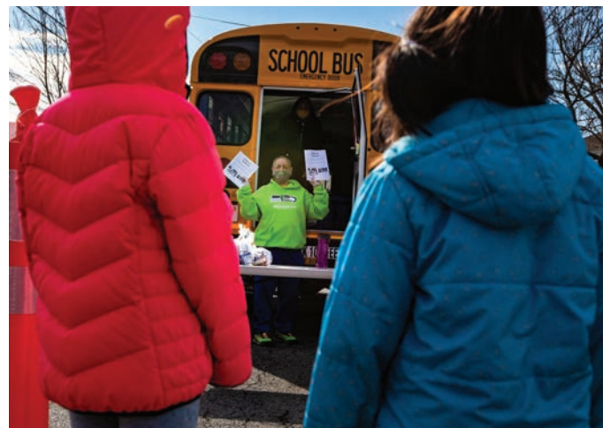
In Salem, two students wait as their teacher held up learning packets, asking how many they needed.

And our Earthwhile team made WBUR the go-to source for information about the controversial natural gas compressor in Wey-