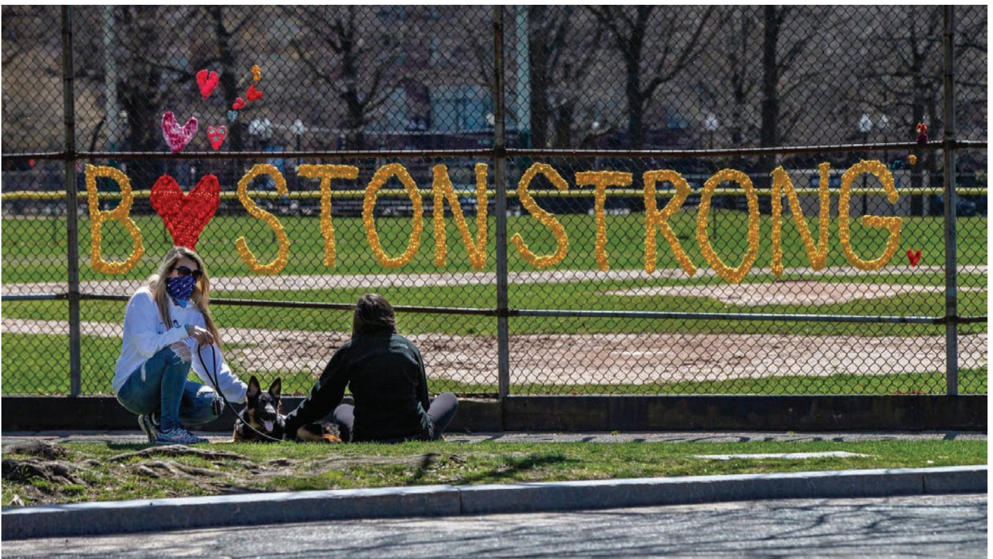
Two women sit with their German Shepherd Niko in front of a yarn sculpture on the fence on Boston Common.

In these pages, we revisit some of the signature events of this extraordinary year, showcasing the stories, projects, and photographs that brought the news home to you.