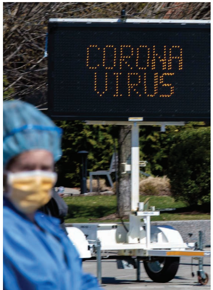
A health care worker looks to cross Huntington Avenue.

In March, as we saw how fear and confusion were spreading alongside the virus, WBUR launched a coronavirus newsletter . Subscribers quickly joined, and by year's end more than 13,000 people were receiving weekly updates and breaking news alerts. We also compiled online explainers and answers to frequently asked questions with links to health and financial resources , information on workers' and employers' rights and obligations , and most recently a rundown of vaccine distribution in Massachusetts .