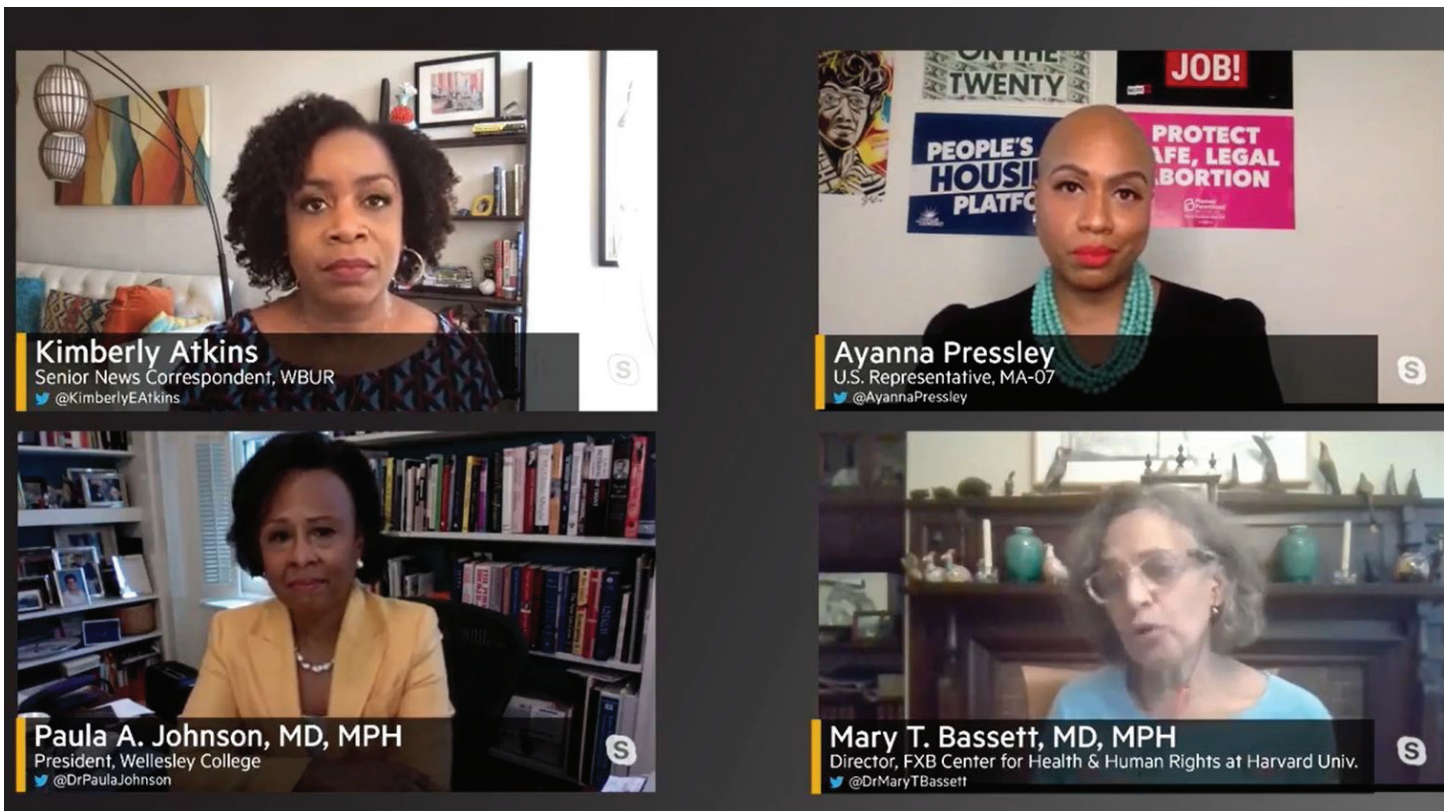
WBUR Town Hall: The Racial Inequities Revealed by COVID-19 (June 9)

Meanwhile, CitySpace at The Lavine Broadcast Center offered the WBUR Town Hall series : an opportunity, broadcast live on YouTube, for journalists and experts to connect with the community and answer questions in real time. Those conversations explored some of the broader implications of the pandemic, from what it revealed about racial inequities to its ramifications for the presidential election.