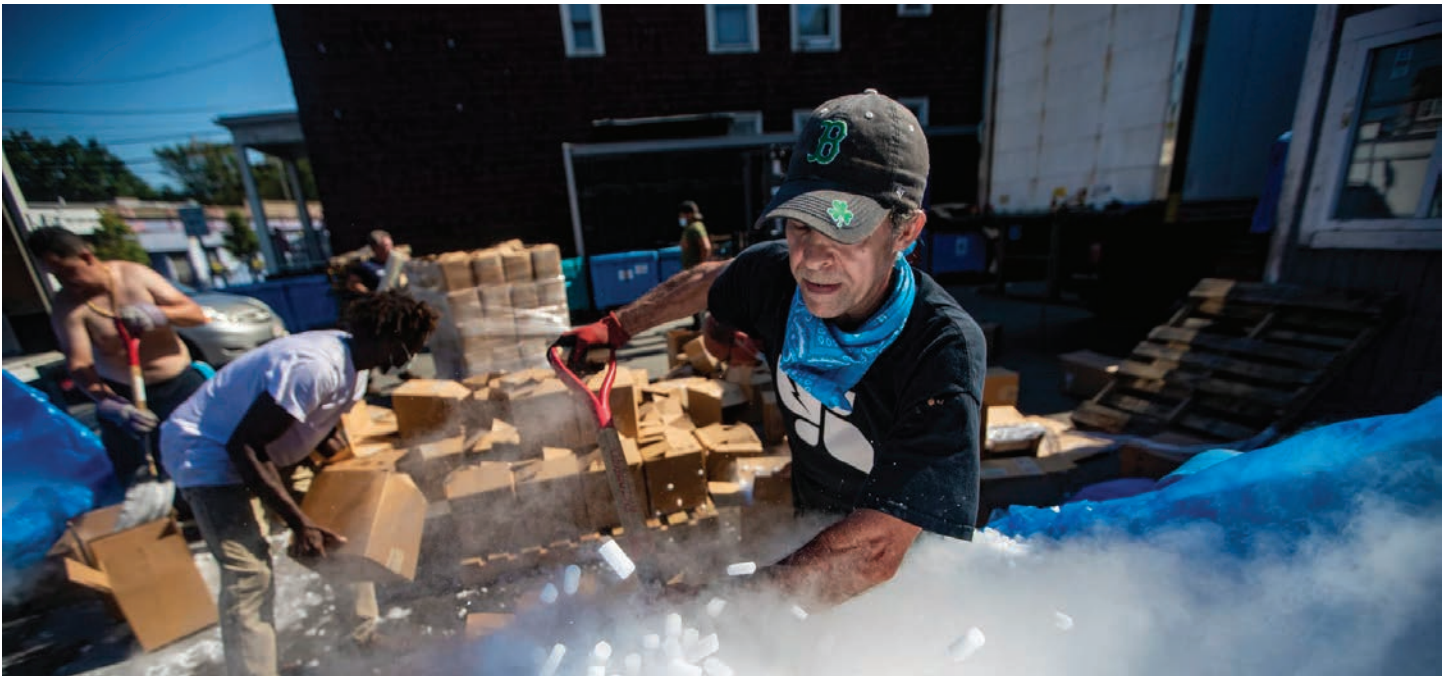
Workers at the Acme Ice Company in Cambridge loads 50,000 pounds of dry ice into boxes to be shipped out to various pharmaceutical companies in the area for storing samples of COVID-19 vaccines.