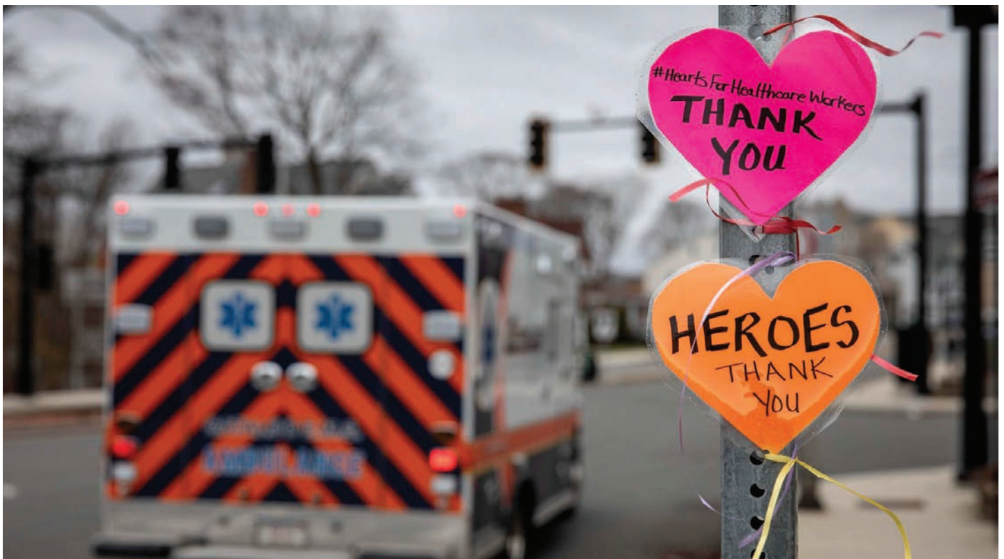
A message is left on a street signpost near Melrose Wakefield Hospital.