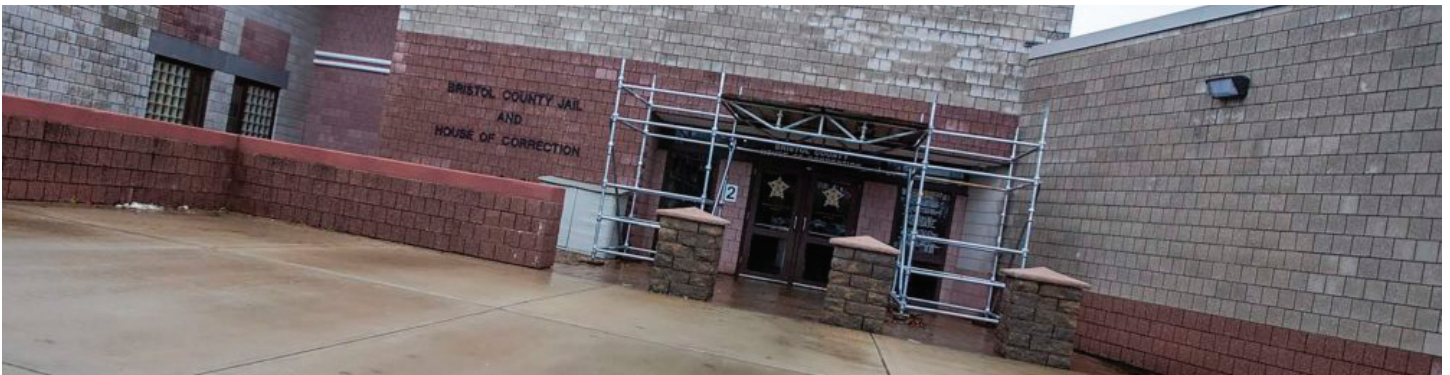
Bristol County Jail and House of Correction in Dartmouth.

Early in the pandemic Massachusetts struggled to obtain the necessary personal equipment — particularly N95 masks — to protect medical workers, as did most of the country. WBUR found at least three deals in which masks were never delivered or their quality was subpar . In each of these cases, the state pre-paid millions of dollars to brokers. After the media coverage, Attorney General Maura Healey began investigating allegations of price gouging, subpar products and orders that never materialized. A new regulation now prohibits charging unfair prices on goods and services necessary for public health during an emergency.