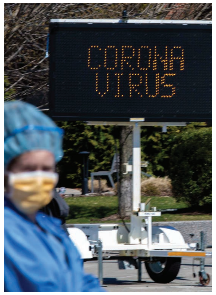
A health care worker looks to cross Huntington Avenue.

In March, as we saw how fear and confusion were spreading alongside the virus, WBUR launched <u>a coronavirus newsletter</u>. Subscribers quickly joined, and by year's end more than 13,000 people were receiving weekly updates and breaking news alerts. We also compiled online explainers and answers to frequently asked questions with links to <u>health and financial resources</u>, <u>information on workers' and</u> <u>employers' rights and obligations</u>, and most recently <u>a rundown of vaccine distribution in</u> <u>Massachusetts</u>.