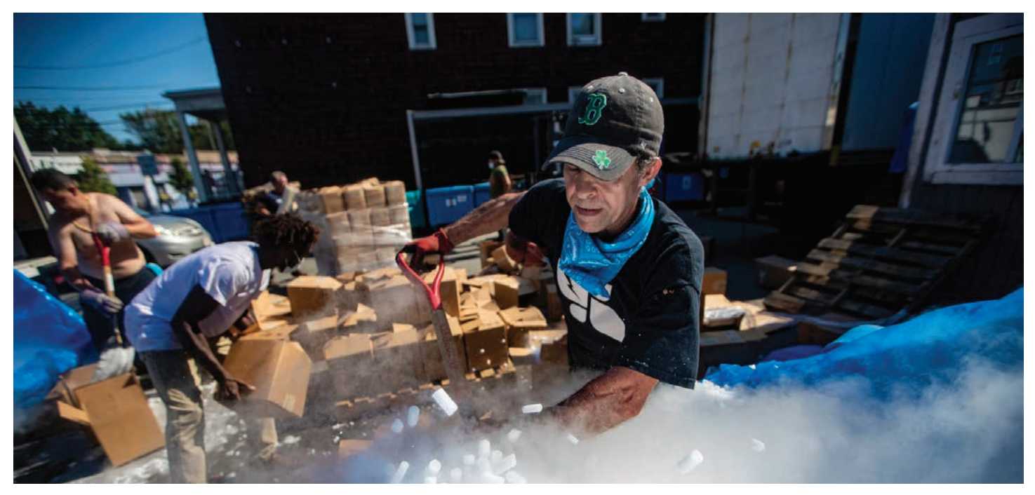
Workers at the Acme Ice Company in Cambridge loads 50,000 pounds of dry ice into boxes to be shipped out to various pharmaceutical companies in the area for storing samples of COVID-19 vaccines.