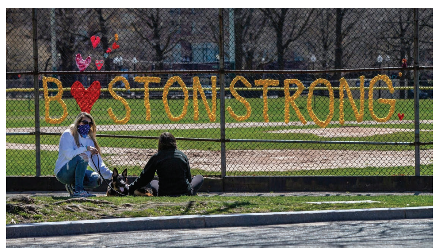
Two women sit with their German Shepherd Niko in front of a yarn sculpture on the fence on Boston Common.

In these pages, we revisit some of the signature events of this extraordinary year, showcasing the stories, projects, and photographs that brought the news home to you.