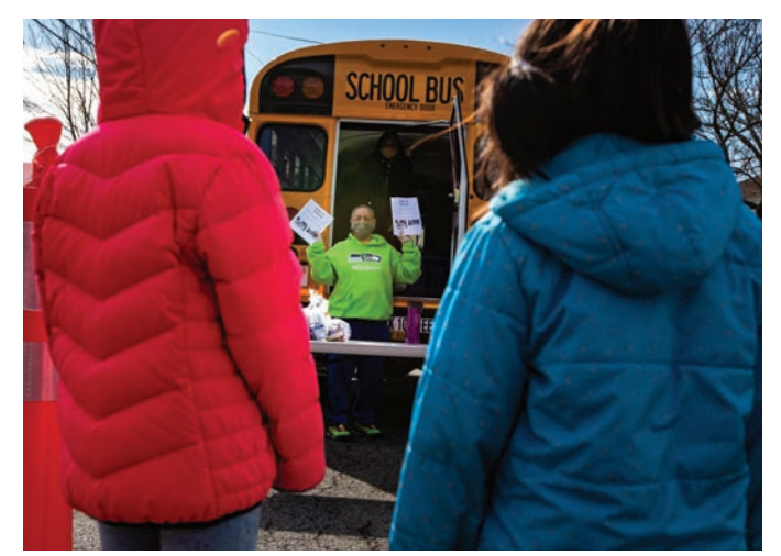
In Salem, two students wait as their teacher held up learning packets, asking how many they needed.

And our Earthwhile team made WBUR the go-to source for information about <u>the con-</u> troversial natural gas compressor in Wey-