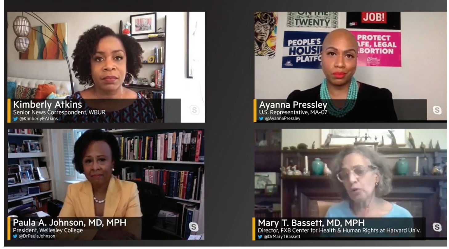
WBUR Town Hall: The Racial Inequities Revealed by COVID-19 (June 9)

Meanwhile, CitySpace at The Lavine Broadcast Center offered the <u>WBUR Town Hall series</u>: an opportunity, broadcast live on YouTube, for journalists and experts to connect with the community and answer questions in real time. Those conversations explored some of the broader implications of the pandemic, from what it revealed about racial inequities to its ramifications for the presidential election.