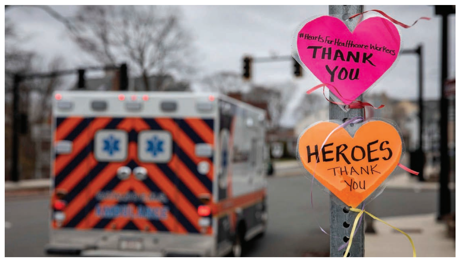
A message is left on a street signpost near Melrose Wakefield Hospital.