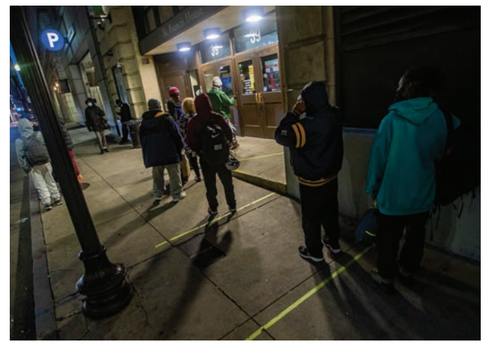
From top: An inmate walks down the hallway of a cell unit at Worcester County House of Corrections; Chelsea residents leave the back entrance of Pan Y Cafe with groceries distributed by the Chelsea Collaborative; people experiencing homelessness stand outside St. Francis House in Boston.